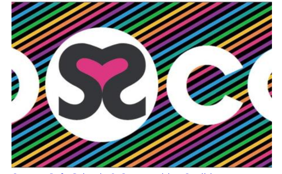
Oregon Safe Schools & Communities Coalition