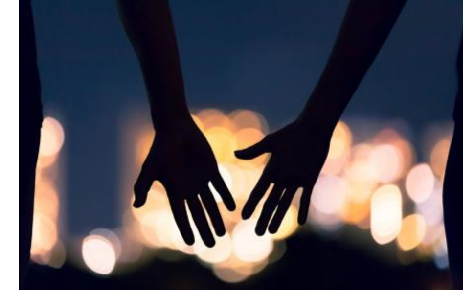
Sexually Transmitted Infections