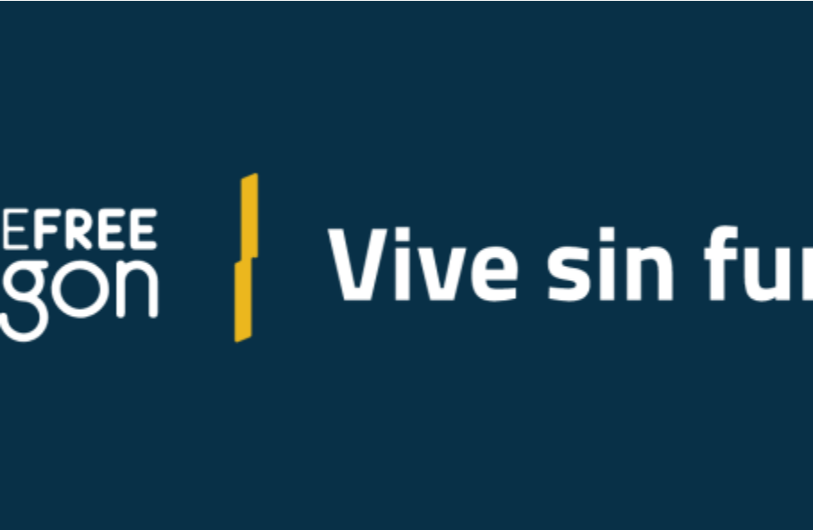
Vive Sin Fumar