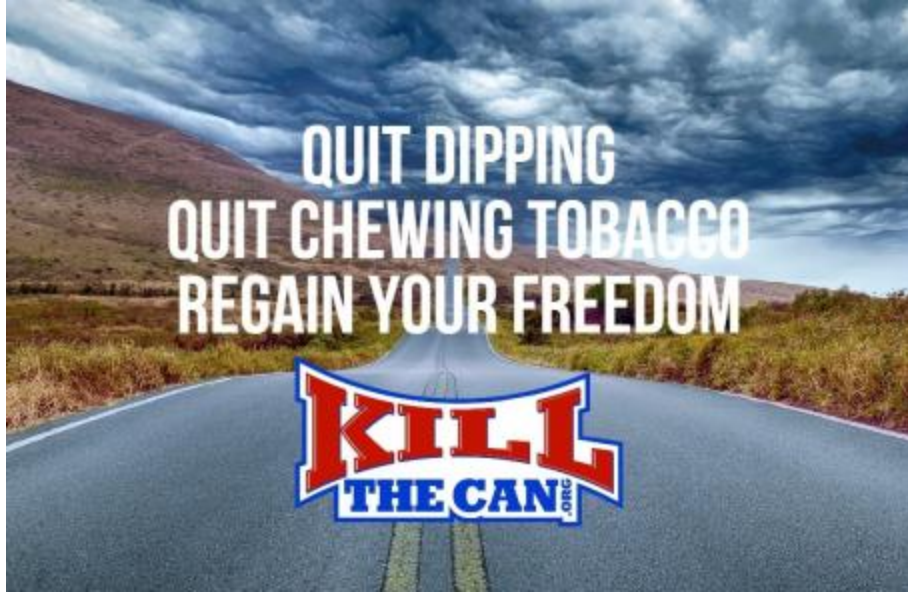
Kill the Can Org