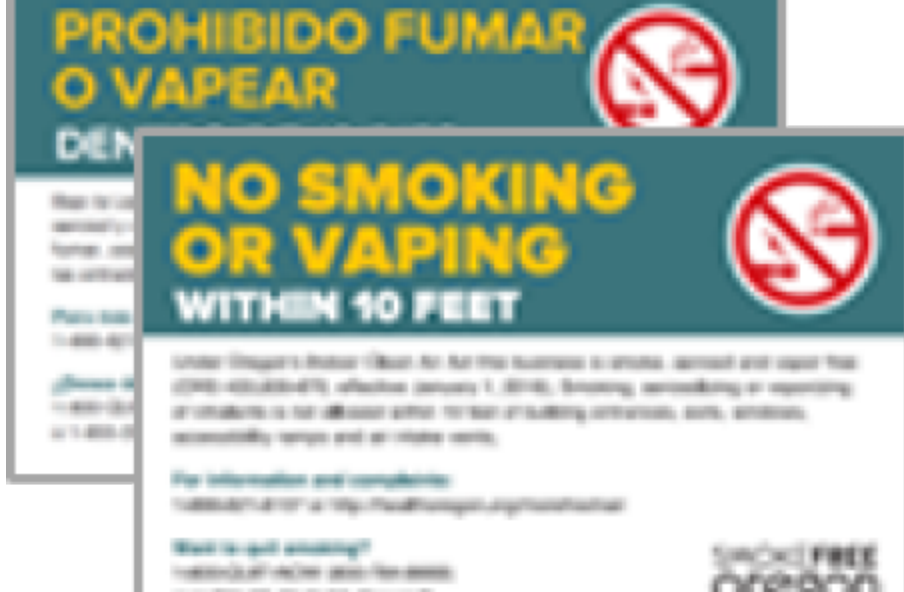
Indoor Clean Air Act, Oregon Health Authority