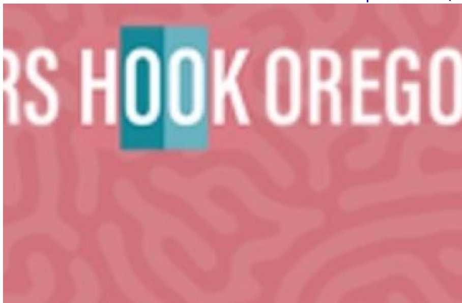
Flavors Hook Oregon Kids