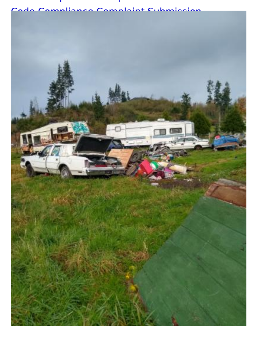
Code Compliance Complaint Form

This property on Highway 30 used to have trash accumulation and inoperable vehicles. Code Compliance staff were able to work with the property owner to clean up the site and bring the property into compliance. Code Compliance can make a difference in your neighborhood as well.